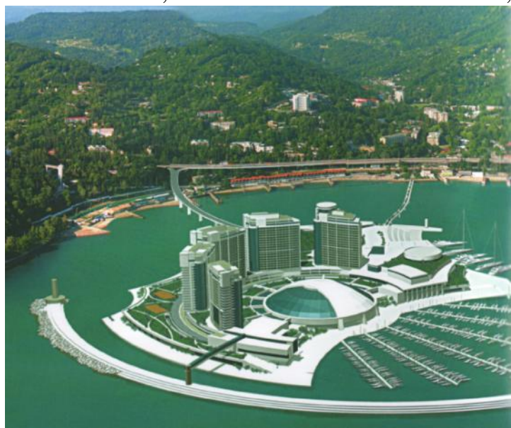
. 2. « »

- ( - , . .); - . , , - , - - . . . 3. , : - ; - ; - . 4. , ( ), , . , : - , - ; - , ; - ; - . , . , - « » , « » - . 2, 3.