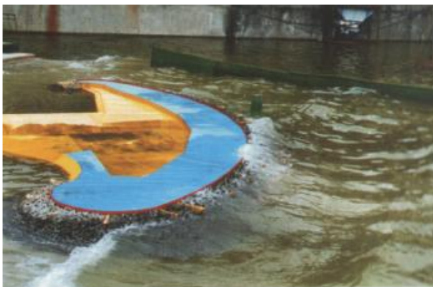
. 5. « » « »

- - , , : - - « » ( . ), ( . 5) , - . 6; - - , [1]. - - , - [2]; - - .