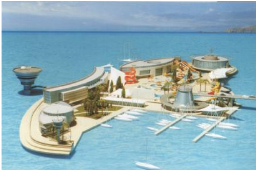
. 4. 3-D « »

- - , , : - - « » ( . ), ( . 5) , - . 6; - - , [1]. - - , - [2]; - - .